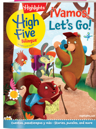
High Five Bilingüe Ages 3–5 Learn More >