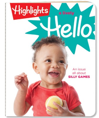
Hello Ages 0–2 Learn More >